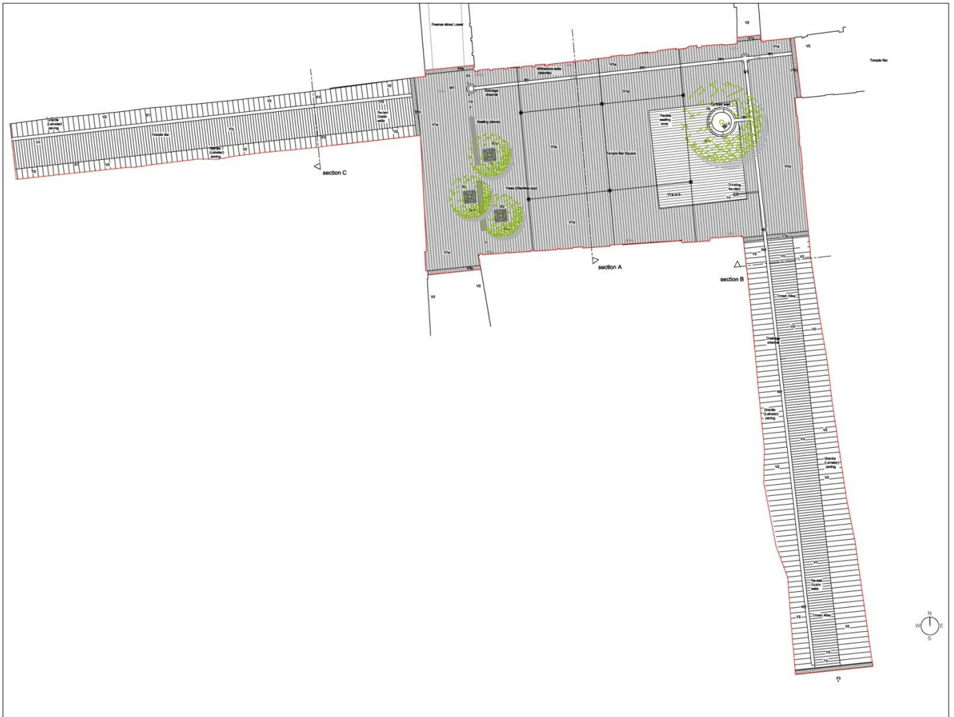
Layout plan 1:200